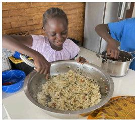
Time to eat!