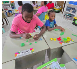
Learning is fun!